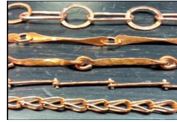
Fab 3 Intensive